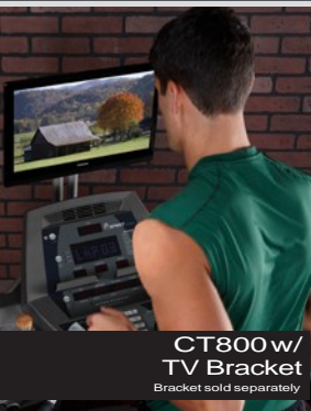
CT800 w/ TV Bracket Bracket sold separately

The CT800 features convenient adjustments and monitoring, critical feedback such as actual Heart Rate and % of projected max, and creative programs including a Fit Test utilizing the Gerkin Protocol. All of these attributes make it a great addition to any commercial environment.