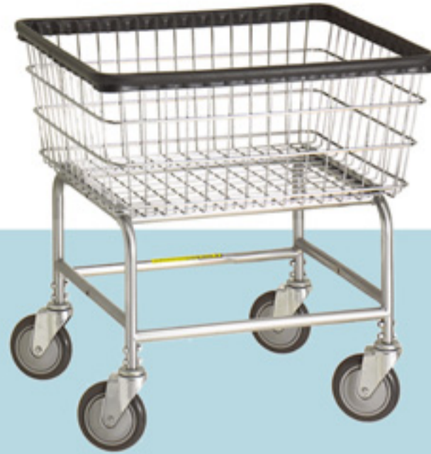
100E Standard Capacity Cart 2 1/2 Bushel

26 1/2" L x 22" W x 11" D x 27"H 66 1/2"H w/ Double or Single Pole Rack