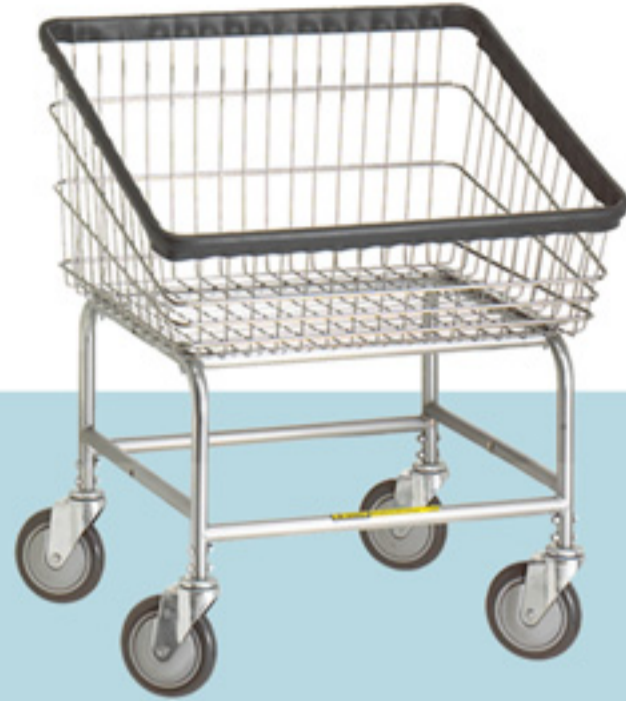
100T Front Load Cart 2 1/4 Bushel

26 1/2" L x 23" W x 14" D x 30"H tapers to 23" 66 1/2"H w/ Double or Single Pole Rack