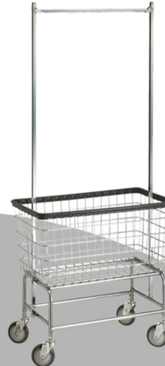
200F 56 (w/ Double Pole Rack) 200F 91 (w/ Single Pole)