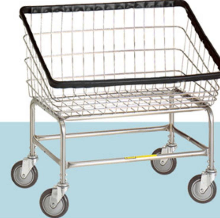
200S Front Load Cart 3 3/4 Bushel

33" L x 19" W x 16" D x 32 1/2" H tapers to 23" 77 1/2" H w/ Double or Single Pole Rack