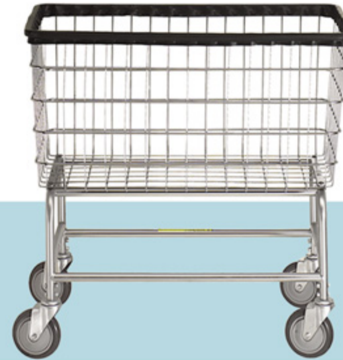
200F Large Capacity Cart 4 1/2 Bushel

33" L x 20" W x 16" D x 32 1/2" H 77 1/2" H w/ Double or Single Pole Rack