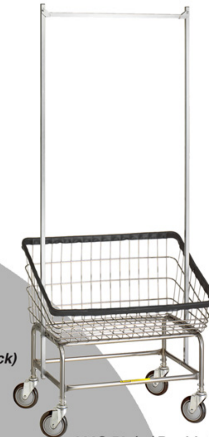
200S 56 (w/ Double Pole Rack) 200S 91 (w/ Single Pole)