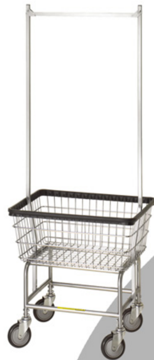
100E 58 (w/ Double Pole Rack) 100E 91 (w/ Single Pole)

Featuring R&B's Patented 'Thread-Guard' Caster Design Keeps Wheels Clean!