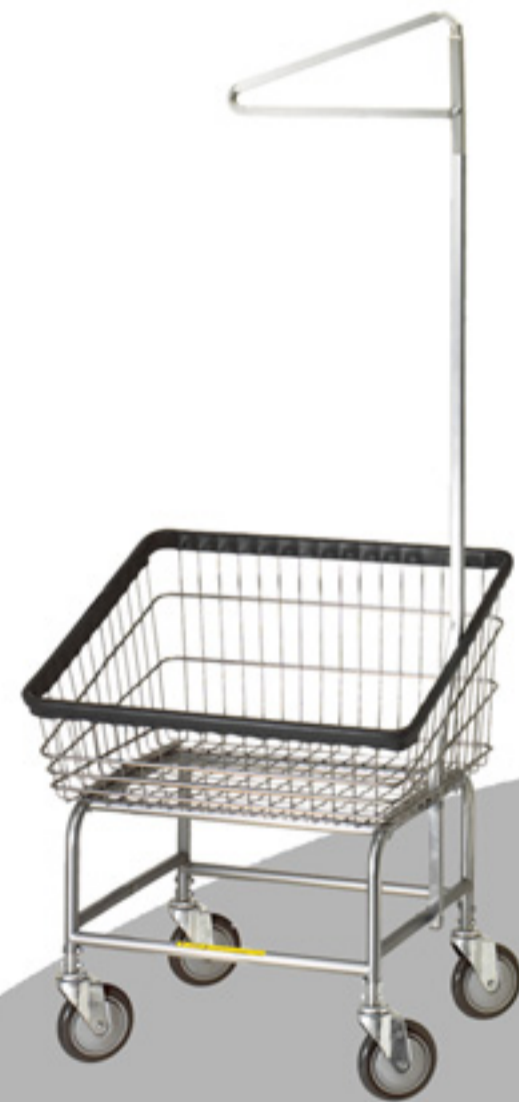
100T 91 (w/ Single Pole Rack) 100T 58 (w/ Double Pole)

Add a Cover Choose 251 for 200 Series Carts Choose 151 for 100 Series Carts