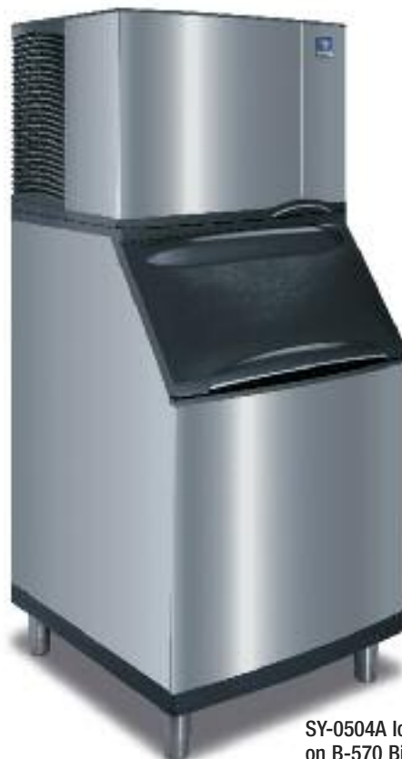
SY-0504A Ice Machine on B-570 Bin